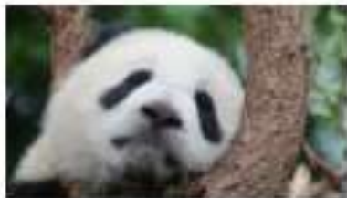
A giant panda

There are two different types of pandas. The giant panda is the most well-known. Giant pandas are very big and have black and white fur. They have round bodies and have black patches around their eyes, over their ears and across their bodies. Red pandas have long tails and are roughly the same size as cats. Both types of pandas have long, sharp claws that they use to climb trees and strip bamboo.