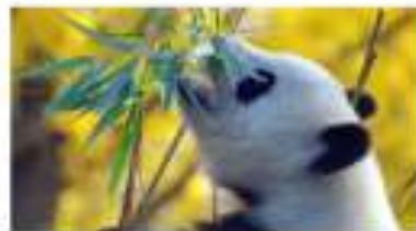
A panda eating bamboo

Pandas are quite fussy eaters! They normally eat bamboo, which is a type of grass. Most giant pandas will eat the equivalent of almost half their weight in bamboo every single day.