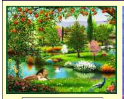
Garden of Eden