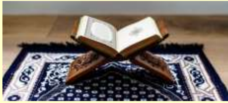
Qur'an (Muslim holy book)