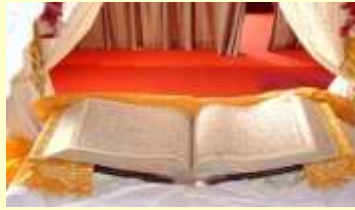
Guru Granth Sahib (Sikh holy book)