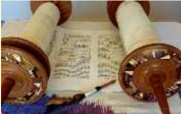
Torah (Jewish holy scrolls)