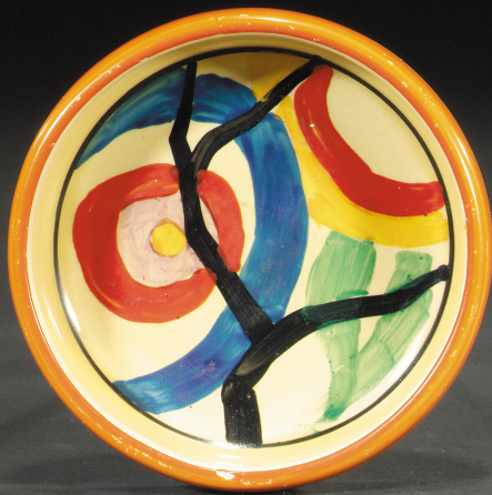
Clarice Cliff An English artist who created pottery.