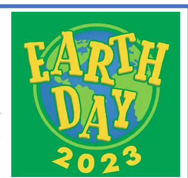
activities, linked to geography, science, history

DKH celebrated Earth Day on Friday 21st of April. The theme was Invest in our Planet. Pupils took part in various Earth Day activities, linked to