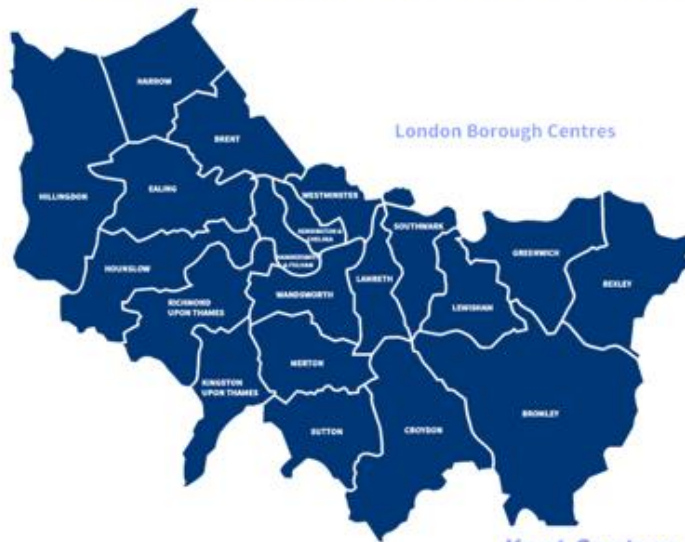
London Borough Centres

FREE TASTER SESSION AVAILABLE ACROSS THE FOLLOWING AREAS AND ONLINE